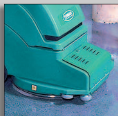
Floating head design