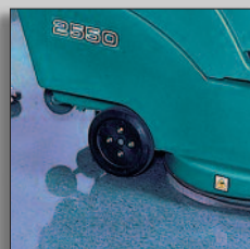
Large transport wheels