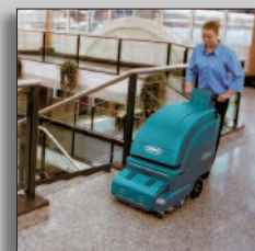
Machine in action