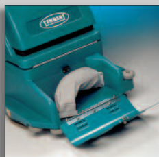
Easy access to filter bag